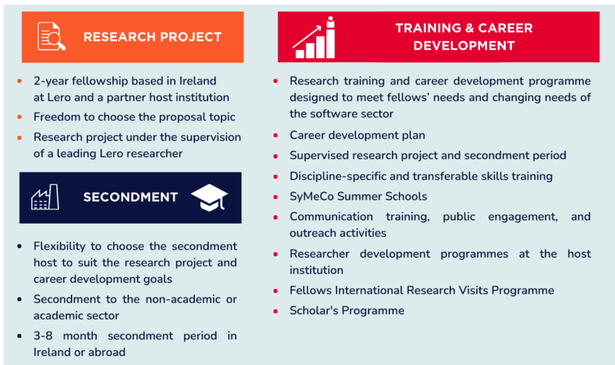
Figure 1:1 SyMeCo fellowship overview